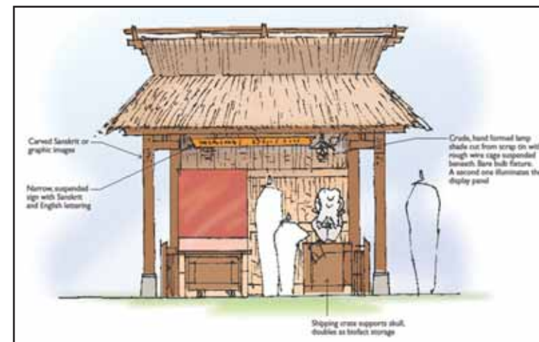
A drawing of the Elephant Skull Interpretive Hut located in the Preserve.

The Elephant Skull Interpretive Hut is a wonderful example. This educationally-rich interpretive station will be located along the pathway in the Preserve area within Asian Tropics. The hut will house educational exhibits including elephant bones scattered around the hut to resemble remains found in the wild. An elephant skull replica also will be mounted inside the hut with interactive activities surrounding it. This naming opportunity is available with a $100,000 gift to Asian Tropics. If you are interested in learning more about this or other opportunities, please contact the campaign office at 303-376-4939 or asiantropicscampaign@denverzoo.org .