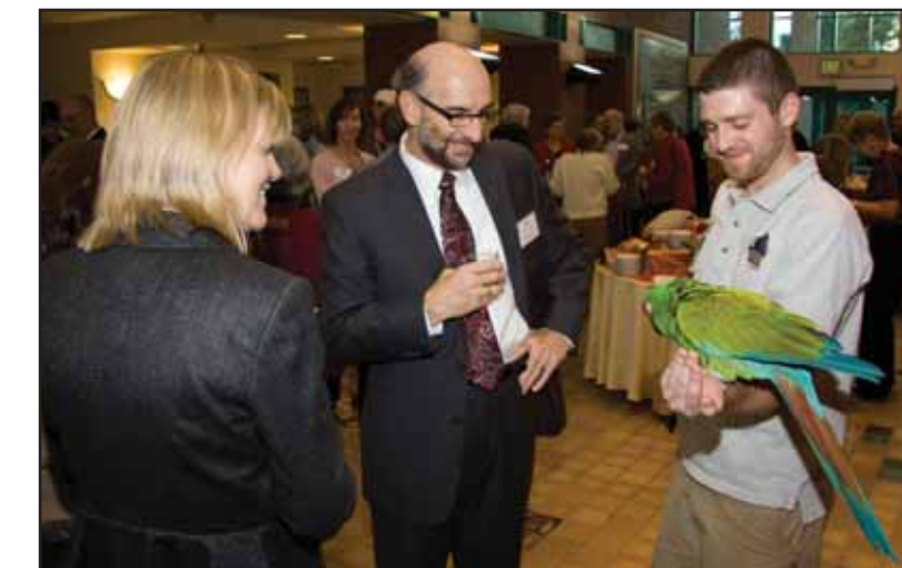
More than 140 Wildlife Heritage Society members and their guests were honored at the tenth annual Wildlife Heritage Society dinner sponsored by BNY Mellon Wealth Management. The Wildlife Heritage Society recognizes the valuable contributions of friends who have included the Denver Zoo in their wills or other estate plans.

Another improvement to the building is a slotted wall which will be used for protected contact foot care for the elephants. To learn more about how we are preparing Mimi and Dolly for their big move, checkout the daily keeper talk at the pachyderm building at 11:30 a.m.