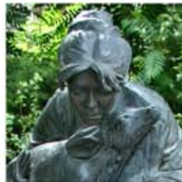
Cares For Her Brother